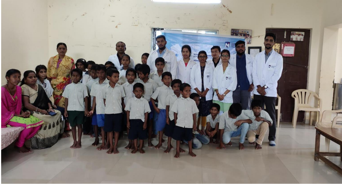
STAFF AND STUDENTS AT SRI KANAKADASA SEVA SAMITHI RESIDENTIAL SCHOOL FOR DESTITUTE