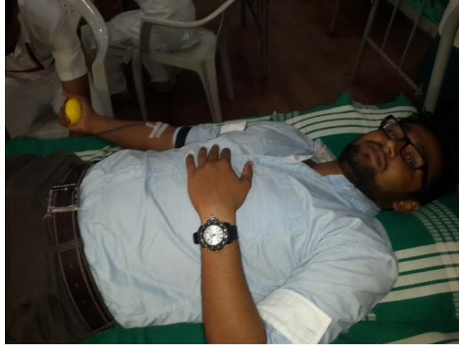
INTERN OF NDCH DONATING BLOOD