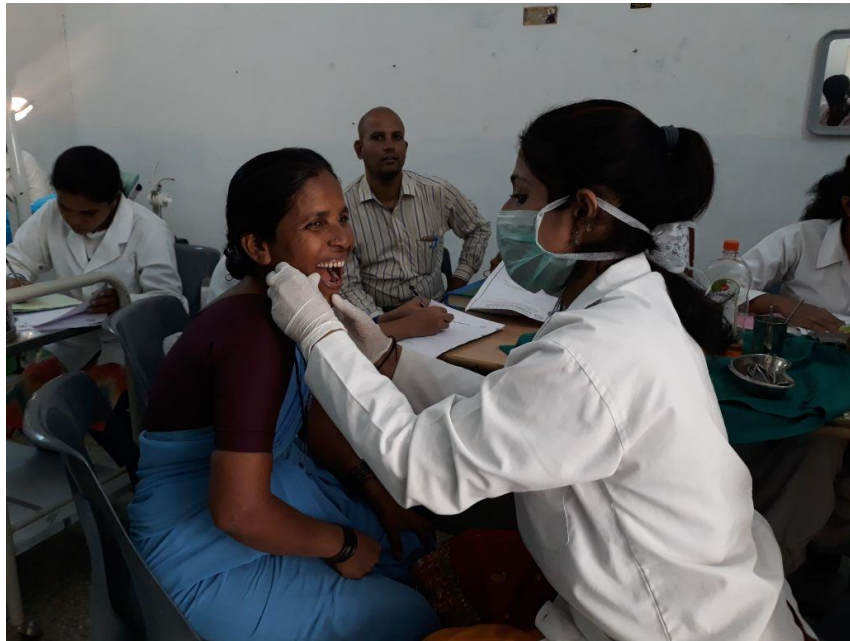
STUDENTS SCREENING FOR ORAL CANCER IN PATIENTS OF THE CAMP

and sub-urban areas of the Raichur city. Doctors examined the oral cavity of patients and reported the various precancerous changes in the oral mucosa of the patients. Various demonstrations using audio visual aids regarding the various causes of cancer were demonstrated to the people who attended the camp. Habit breaking and tobacco cessation advice was demonstrated by the trained doctors to the individuals. Patients who require further treatment and proper advanced habit breaking counselling were referred to Navodaya Dental College and Hospital Raichur. Nearly 300 patients were screened in this one month duration. 'The team motivated the patients regarding the lesions in mouths and how it could lead to cancer in certain cases'. This programme was conducted with a hope that we can move a step forward towards a cancer free society.