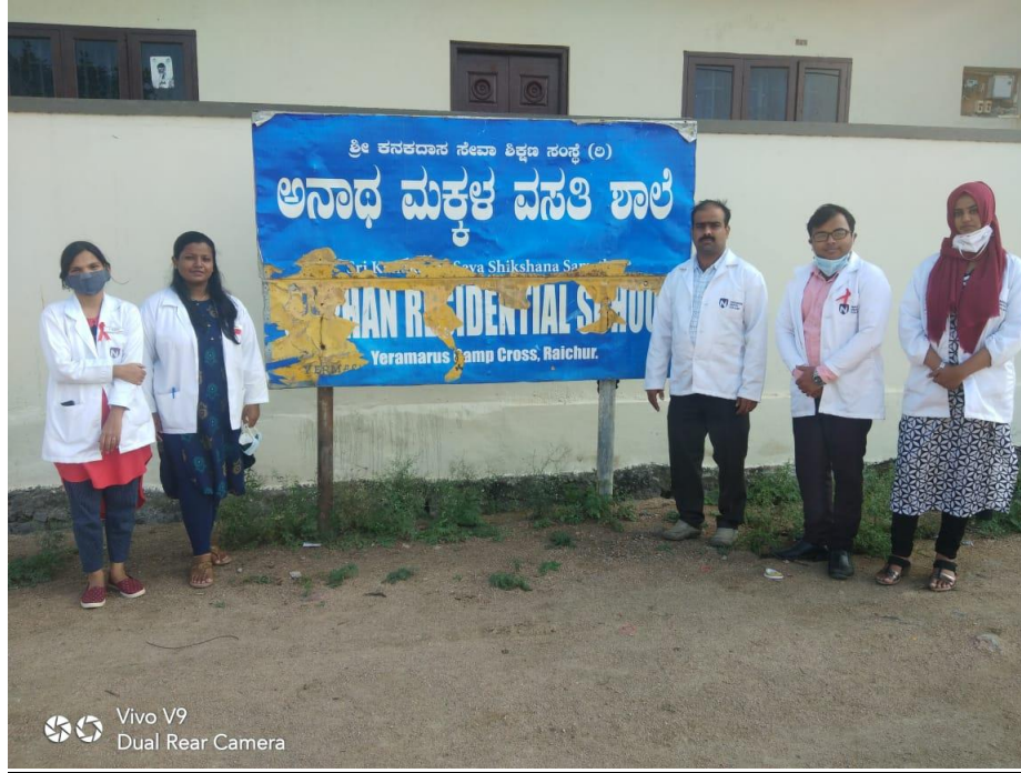
DOCTORS AND STUDENTS OF DEPARTMENT OF PUBLIC HEALTH DENTISTRY AT : KANKADASA ORPHANAGE CENTRE, ON WORLD AIDS DAY,