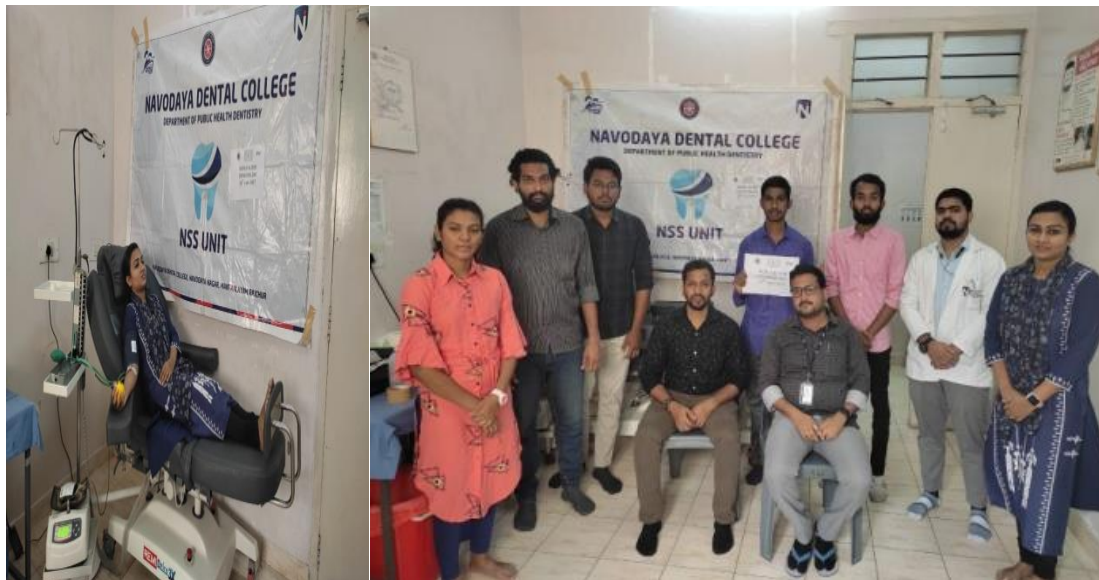
STUDENT OF NDCH DONATING BLOOD

In order to highlight the importance of blood donation among the people, a dental screening camp was conducted by the Department Of Public Health Dentistry, Navodaya Dental College And Hospital . They were encouraged to donate on regular basis. The benefits of blood donation were taught to the attendees. Then oral screening was done for the participants and depending on their needs. was referred to NDCH for their respective treatments. A V's were showed to patients and they were educated on various aspects of dental problems. The referred patients were also followed up after their first visit to guide them along the course of treatment. All the individuals who got gathered at the camp were screened for oral health. All of them were referred to NDCH with referral slip so as to get the treatment done. Students who attended the camp distributed pamphlets with awareness quotes about blood donation to the people.