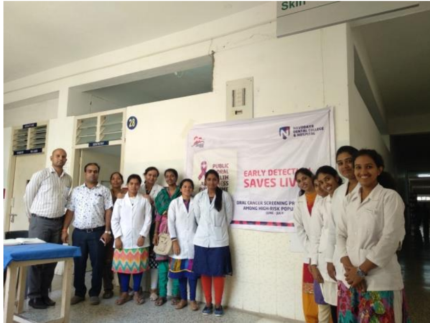
STAFF MEMBERS AND STUDENTS AT ORAL CANCER SCREENING CAMP