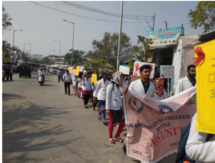
STAFF AND STUDENTS OF NDCH ON A RALLY TO RAICHUR DISTRICT HEALTH OFFICE