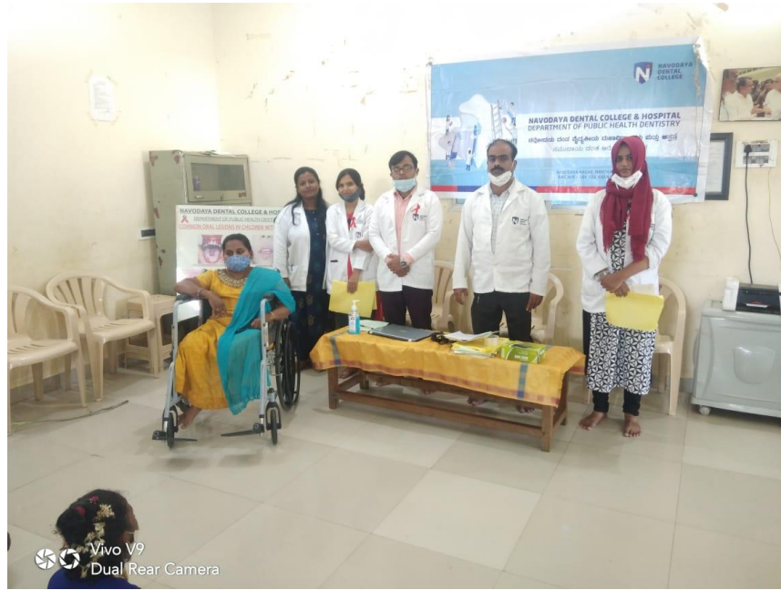
DOCTORS AND STUDENTS OF DEPARTMENT OF PUBLIC HEALTH DENTISTRY AT : KANKADASA ORPHANAGE CENTRE, ON WORLD AIDS DAY,