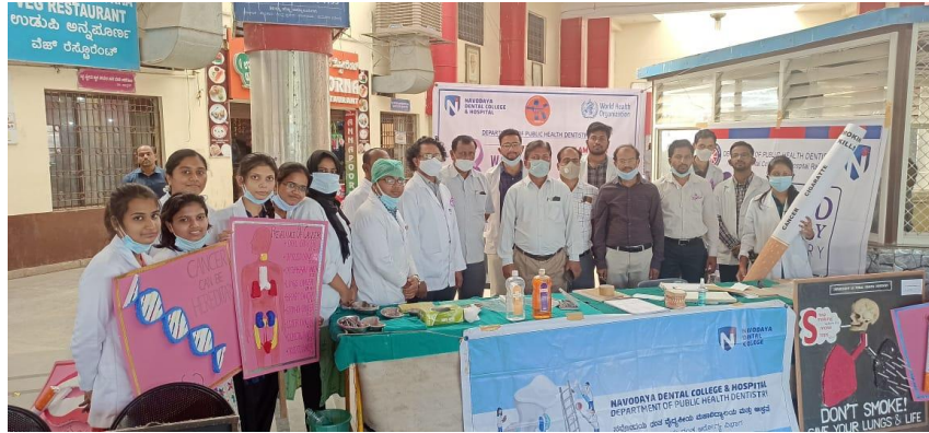
A GROUP PHOTO WITH DEPO MANAGER AND STAFFS AND STUDENTS OF DEPARTMENT OF PUBLIC HEALTH DENTISTRY