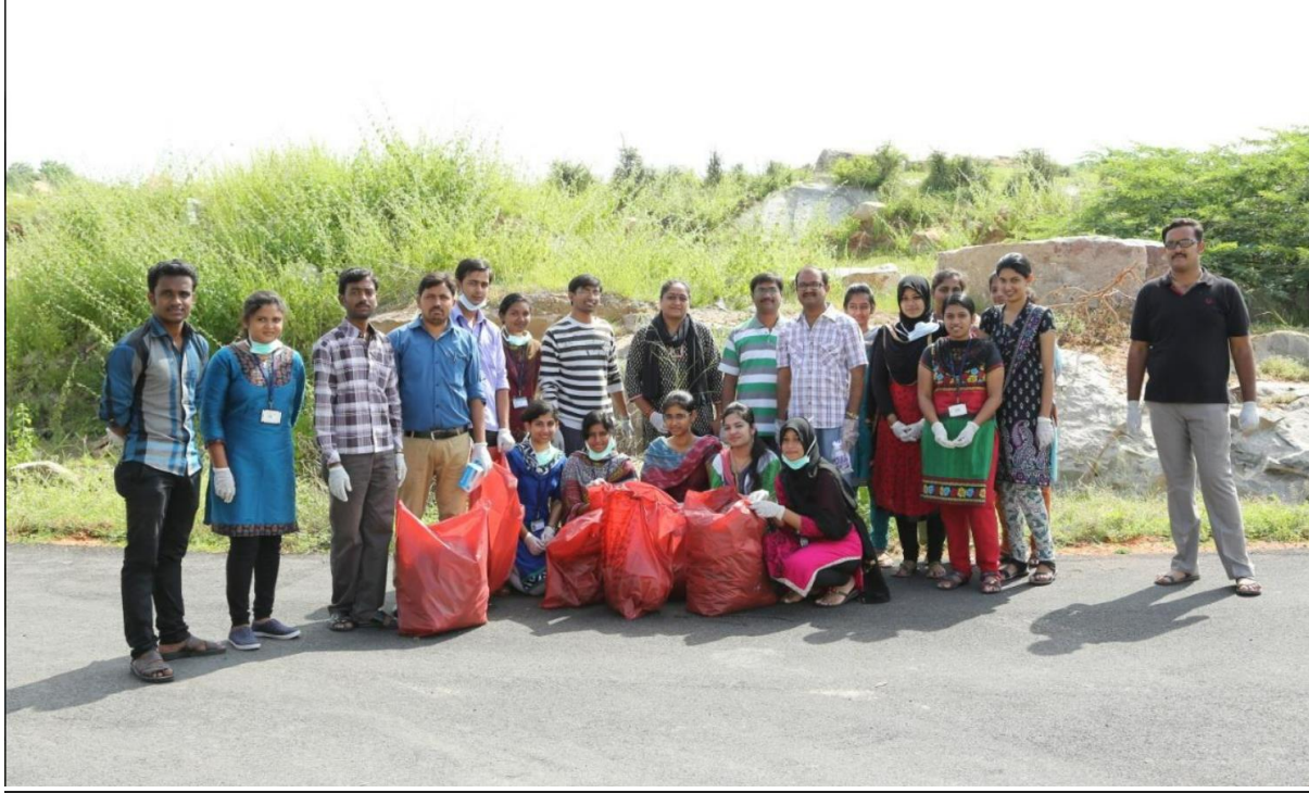
STUDENTS AND STAFF ENGAGED IN CLEANING THE NET CAMPUS GROUND