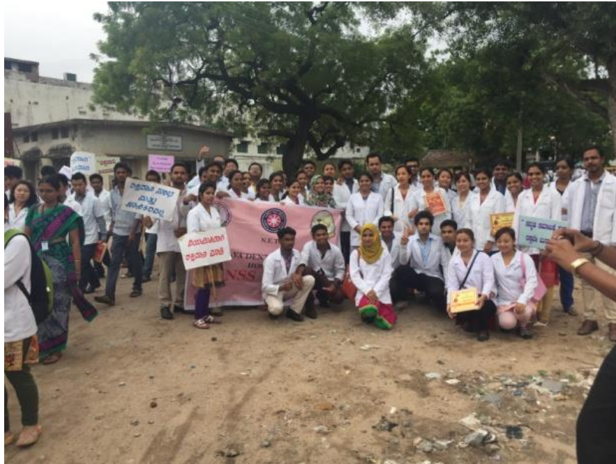
BLOOD DONATION AWARENESS BY THE STUDENTS OF NDCH