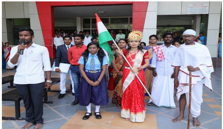
SKIT PERFORMANCE STUDENTS OF NDC