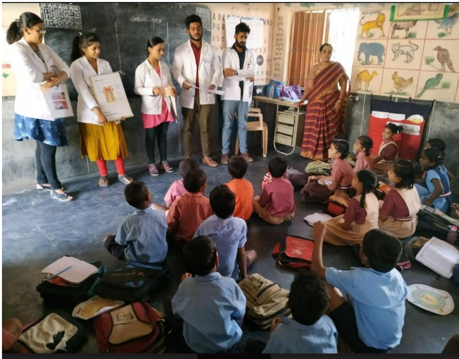
STUDENTS DEMONSTRATING ORAL HYGIENE HABITS FOR SCHOOL CHILDREN OF ZAHEERABAD SCHOOL

ORAL HEALTH AND AWARENESS AND DENTAL SCREENING CAMP WAS ORGANIZED IN ZAHEERABAD SCHOOL ON 28/02/2019. THE CHILDREN WERE MOTIVATED TO DEVELOP GOOD ORAL HYGIENE PRACTICES. THE TEAM OF DENTISTS CARRIED OUT A COMPREHENSIVE DENTAL CHECK-UP ON STUDENTS FROM CLASS I TO X. THE YOUNG STUDENTS CHERISHED THE CHANCE TO INTERACT WITH THE DENTISTS TO ENQUIRE AND GAIN KNOWLEDGE ABOUT THEIR ORAL HEALTH AND MAINTAINING GOOD ORAL HYGIENE. THE SCHOOL STAFF AND CHILDREN THANKED THE DENTISTS FOR RENDERING THEIR SELFLESS SERVICE TO THE SCHOOL.